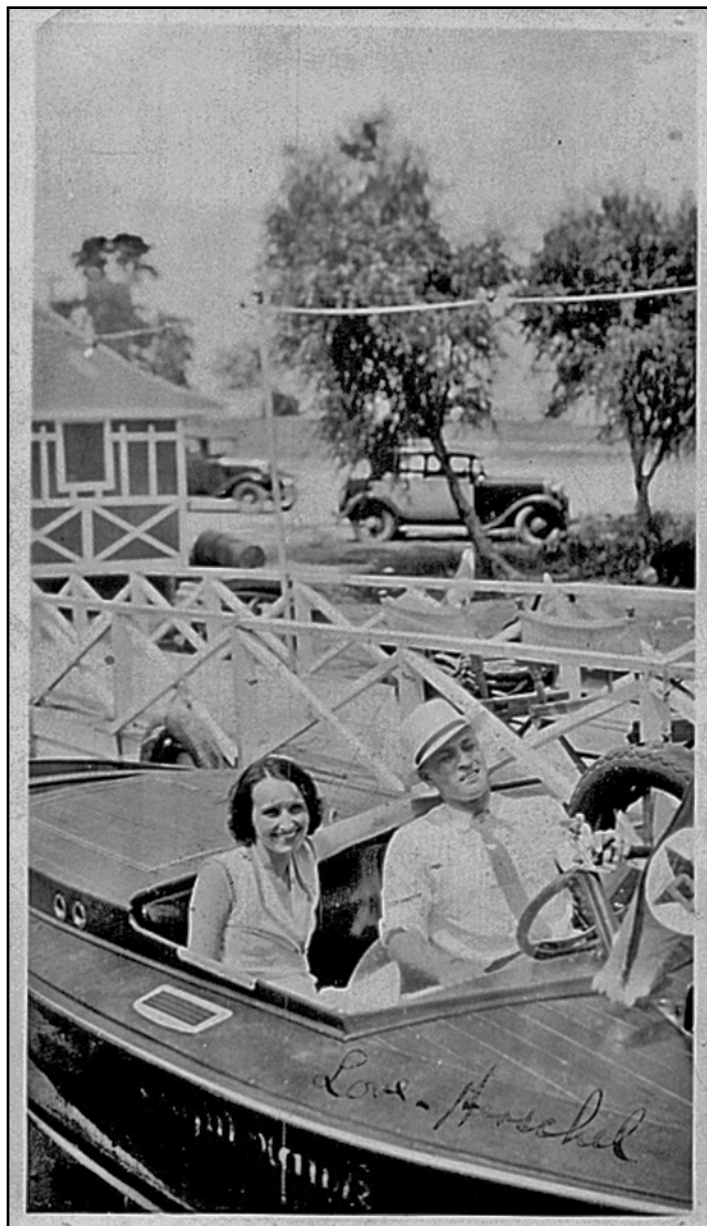
On White Rock Lake, 78 years ago

CSC's Open House and Boat Show will be on Saturday 26 September, from 9am-3pm. The Wooden Boat Association of North Texas will be our special guests this year and will be displaying their antique and classic wooden boats on the water. The event will be free and open to the public, with free sailboat rides and free hot dogs and drinks. Note that the Flying Scot Open House will be on October 17 th .