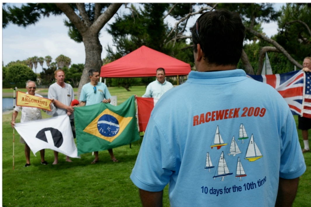
Flag Ceremony at the U.S. Nationals in San Diego, August 6-8 th . People really travel with these boats.

Thanks to the club for allowing the smallest boat sailors to have fun at the lake.